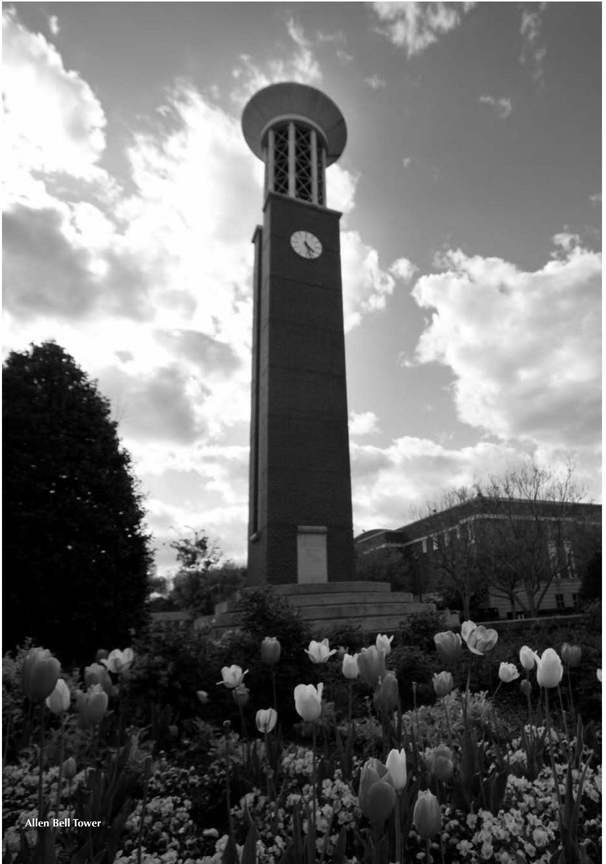
Allen Bell Tower