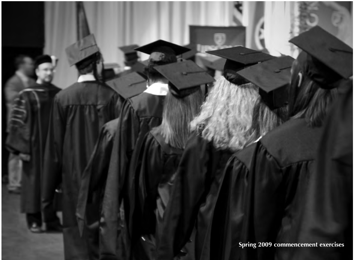
Spring 2009 commencement exercises